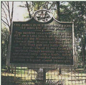
Historical Marker, Sandbar Duel, Adams Co., MS